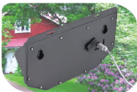
Also rechargeable by USB Perfect in wintertime conditions