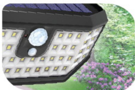
Infrared movement sensor and integrated daylight sensor 3 selectable light modes