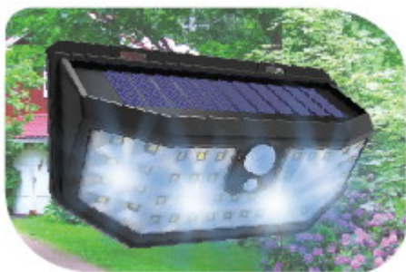
48 LED high performance light

The replaceable 18650 Li-Ion batteries (2 x 1.200 mAh) are charged in daytime by solar power to power the light in nighttime. For wintertime conditions, the Tapir has a built-in micro USB charging port, so you can charge the batteries by USB.